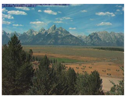
These are actual NetCam customer images. They have not been modified or enhanced in any way.