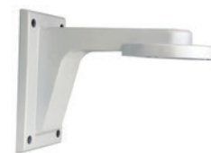
Wall Mount (MNT-VWAL)