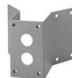
Corner Mount Adapter (MNT-VWAL-COR) For Use with Wall Mount